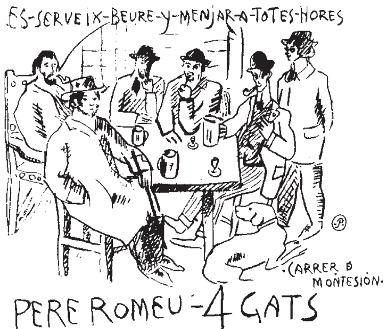
Picasso drawing of a group of Els Quatre Gats regulars seated at a table. Picasso himself appears bearded, wearing a hat and holding a cane, in the left foreground.