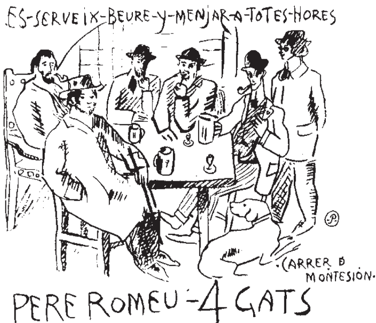
Picasso drawing of a group of Els Quatre Gats regulars seated at a table. Picasso himself appears bearded, wearing a hat and holding a cane, in the left foreground.